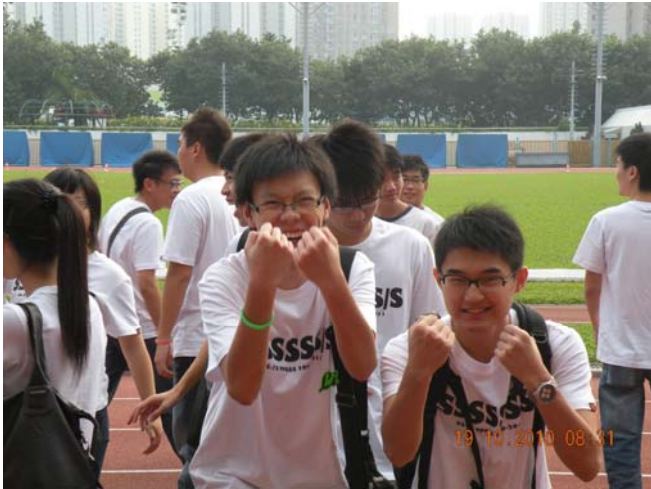
A fighting spirit.

For two days in October all thoughts were firmly focused on our school sports. Here are a few of the pictures taken and the school spirit that they capture.